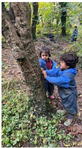
Bumble Bees have been reading the traditional story, The Three Little Pigs.