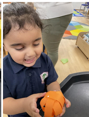
Busy Bees went for an Autumn walk to collect leaves. They then all created collages using what they had found.