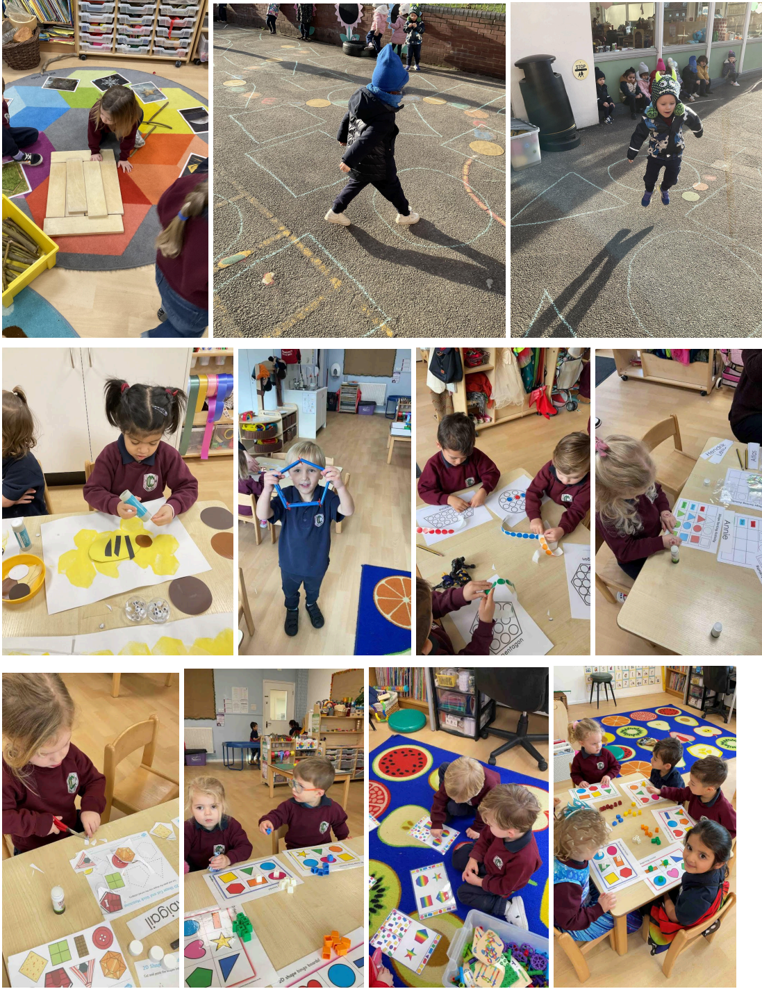
The children were fascinated by the tessellation of a hexagon which moved onto the shape of honeycomb and finally to making some honey and cinnamon biscuits.