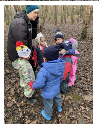
Bumble Bees have been reading the book Lazy Ozzie which linked into their theme of 'day and night'.