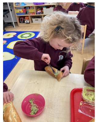
Bumble Bees explored 'Places I like to Visit' so there were activities linked to the beach, the park, the farm and others